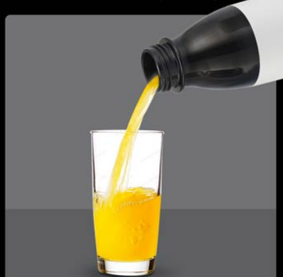
Small Cap To drink & Pour

304 Stainless Steel Bottle New Powder Coated Finish