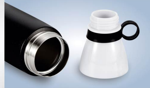
Double Cap Design

Made of 304 grade food-safe stainless steel inside