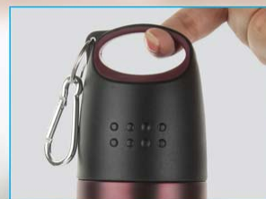
Carabiner on lid to hang and carry easily

Keeps your beverage hot for upto 8 hours and cold upto 12 hours