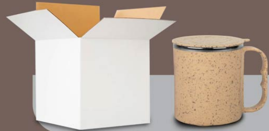
White Gift Box