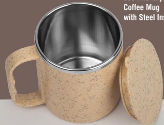
Eco Friendly Coffee Mug with Steel Inside