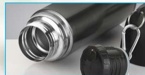
304 stainless steel inside