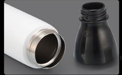
Double Cap Design